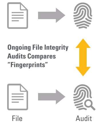
Figure 2: Unique fingerprint enables recurring checks for corrupted files.